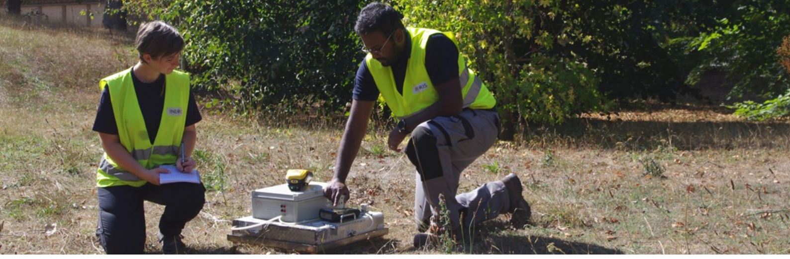
Surface gas flux measurement using the accumulation chamber developed and patented by Ineris.