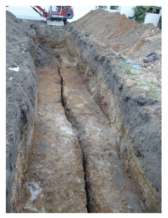
A main fracture unearthed close to the surface.

In the studied area, more than 1,000 fractures were identified and mapped. The fractures have lengths extending from 10 to more than 100 m, widths from 1 to 10 cm and depths down to 10 m.